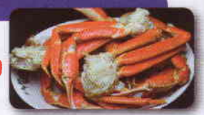
Served with Salad Red Potatoes and Slaw